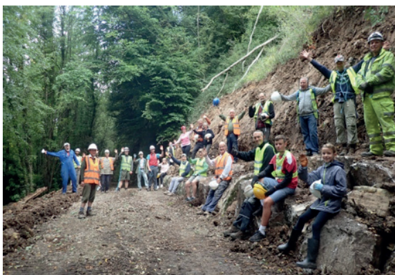
Volunteers at the cleared landslip north of the tunnel

off all the old trackwork north of the tunnel. If you are walking in that area you will notice some lengths of rail left in place. This is to protect a rare species of sedge which likes the outside edge of the rail. Dean Forest Railway are removing the continuous welded rail between the A48 bridge and Sedbury Lane. Hopefully this will all be complete well before Christmas leaving us a clear stone base to build that section of the path.