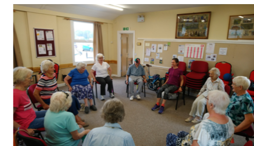
Class in action