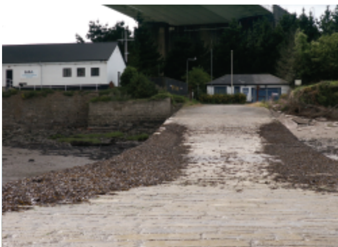
Beachley Slip way was acquired by the Forest of Dean District Council in 1995 for the sum of £1

and was in the Capital Programme in 2006/7 with a budget of £10,000 for repairs. The sum set aside was in fact not spent until, in the following year, £600 was spent on a structural condition survey.